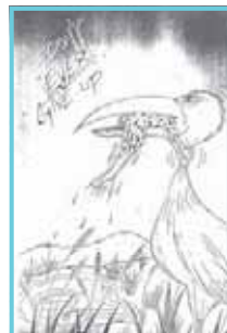
Don't Ever Give Up!

puzzle so that each cell receives the message. Therefore a depressed emotion, for instance, transmits depression to every cell, including the immune cells.